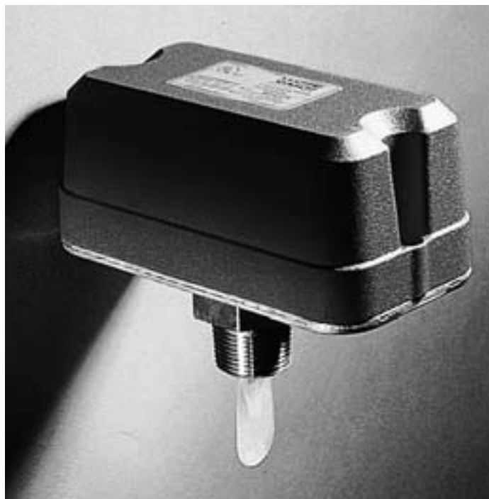
WFDTH Waterflow Detector